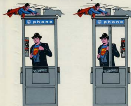
The Phone Booth: Handsome, five-foot motorized unit. Holds LPs on sides. The next best thing to being in the dressing room with Superman!