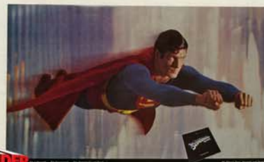
Oversize Poster: Full length, in-flight 3'x6' of you-know-who.