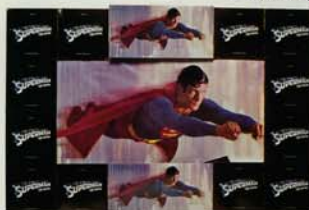
LP Jacket: Oversize Poster. Double your pleasure.

WARNER BROS. RECORDS MERCHANDISING HOTLINE 1-800-423-2440 1-800-232-2102 COAST GUARD ONLY, BOX CA. CALIFORNIA ONLY