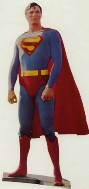
The Stand-Up: The Man of Steel down to size in this 9'6" entry.