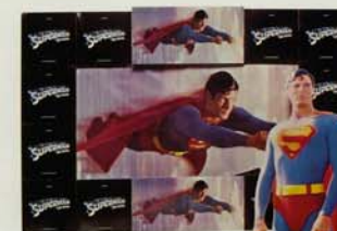
Stand-Up, Oversize Poster, LP Jacket: Three to make one helluva wallful.