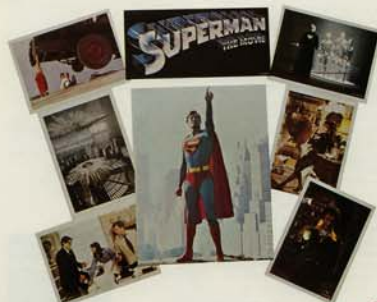
Poster Kit No. 1: Eight-piece combo pack.

WARNER BROS. RECORDS MERCHANDISING HOTLINE 1-800-423-2440 1-800-232-2102 COAST GUARD ONLY, BOX CA. CALIFORNIA ONLY