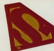
The Patch: Comes complete with official S-Man insignia. Great for all clothing surfaces. Ltd. quantities.